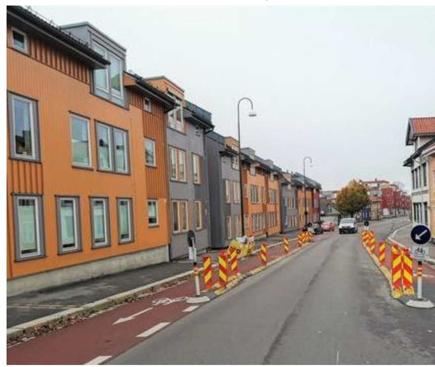
Pop-up protected bike lane experiment in Oslo, Norway