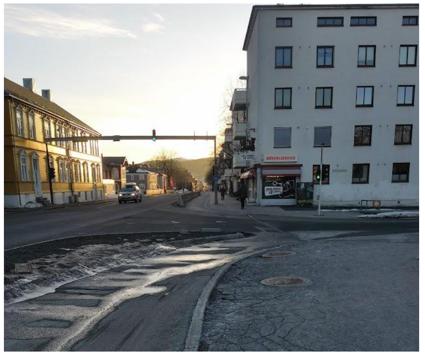
Pilot street space reallocation in Trondheim, Norway