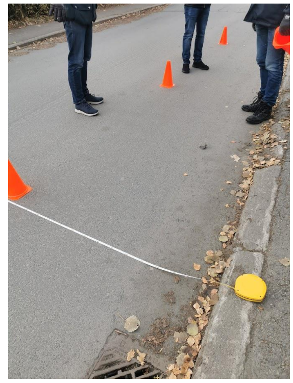
Field meeting for a temporary walkway project in Trondheim, Norway