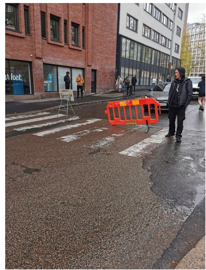
Street closure for 1.May party in Oslo, Norway